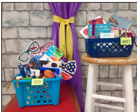
Reading Bingo continues until August 15. Here's a look at some of the goodies included in the prize baskets.

Presenting a virtual Story Time is different in several ways from doing it with a group of children sitting in front