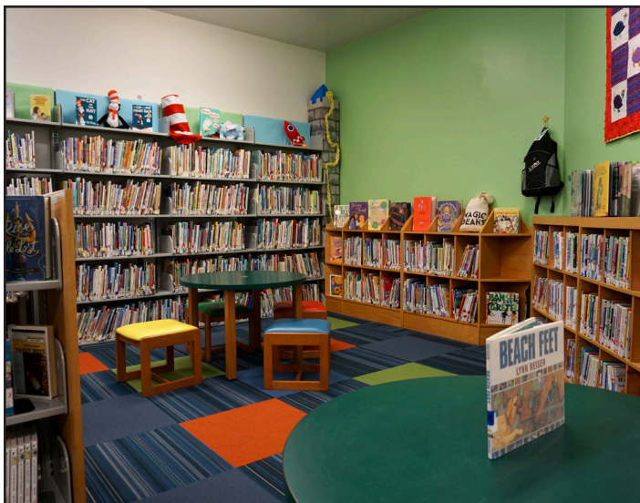
Clockwise: Along with new tables and fresh paint, the raised floor was removed in the children's area. A dozen new computers were purchased along with tables and chairs that are easily cleaned and disinfected. Work areas are more open to allow for physical distancing. A young patron works quietly in the children's area.

“Come in and check out the changes we have made.”