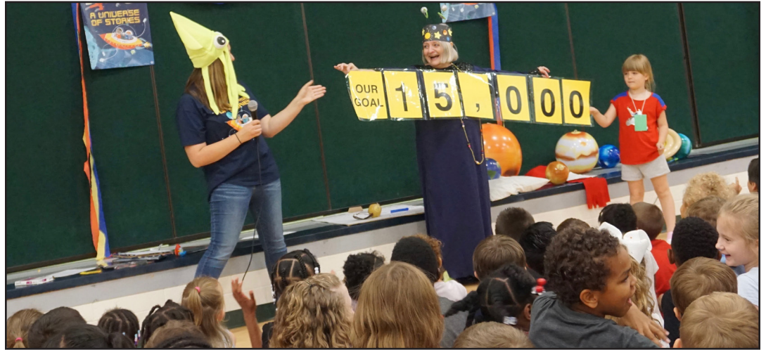
Friends of the Library support the Summer Reading Program as well as receptions for monthly art shows as part of the library's participation in the Virginia Artisan Trail, including artwork by the Northern Neck Home School.

Summer greetings from the Friends of the Northumberland Public Library. The Friends Board hopes all of our members are safe and well during this challenging time in our world, and that as our lives embark upon a "New Normal" we can once again cautiously continue our gathering together for fund raising in support of programs at the library. We are excited to announce a new fundraising adventure we are able to go forward with - 2020 pewter Christmas ornaments in the shape of an oyster that will be available for purchase at the library later this summer. Keep an eye on our Facebook page www.facebook.com/friendsnplva and the library website for an announcement of their arrival! At our most recent Friends