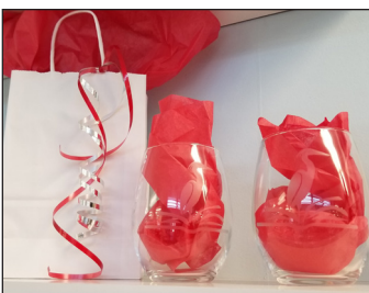
Raise your glass while raising funds for the library. Stemless wine glasses $10 each.

said Walker. "It pays to support the Library!" The Friends also are fundraising with wine tumblers for $10 each. Etched with the blue heron library logo, they are available at the library's front desk. Wine sold at a local vineyard near you.